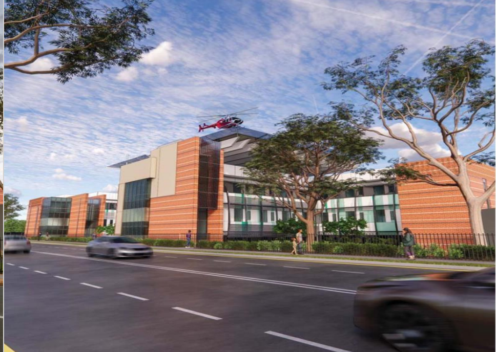
Indicative Helipad & Courtyard Views