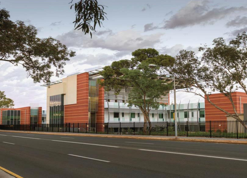
Current Helipad & Courtyard Views